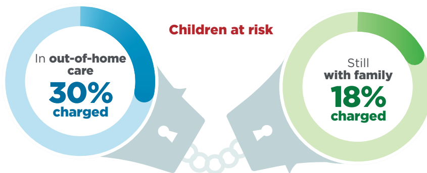
Figure 1: Child protection clients aged 11-17 who go on to seek our assistance for criminal charges

As set out in Figure 1 below, 30% of children we assisted who were placed in out-of-home care later went on to seek our assistance for a criminal matter, compared with 18% of those who were not placed in care. In other words, children placed in out-of-home care were almost twice as likely as those not placed in care to become involved with the criminal justice system.